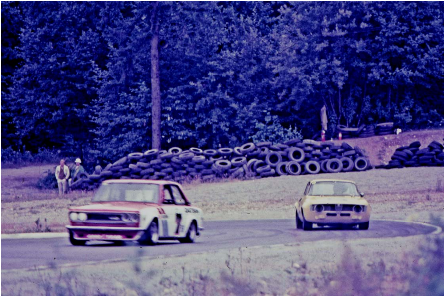
The Datsun 510 1974 at Westwood