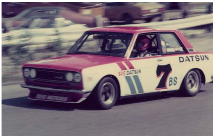
The Datsun 510