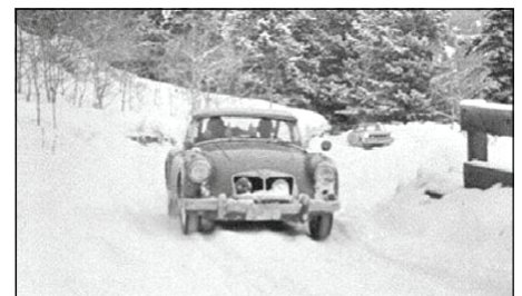
1963 Thunderbird Rally

At age 70, Tom also continues to compete, entering from one to three rallies a year, frequently proving that "Old age and treachery will overcome skill and youth".