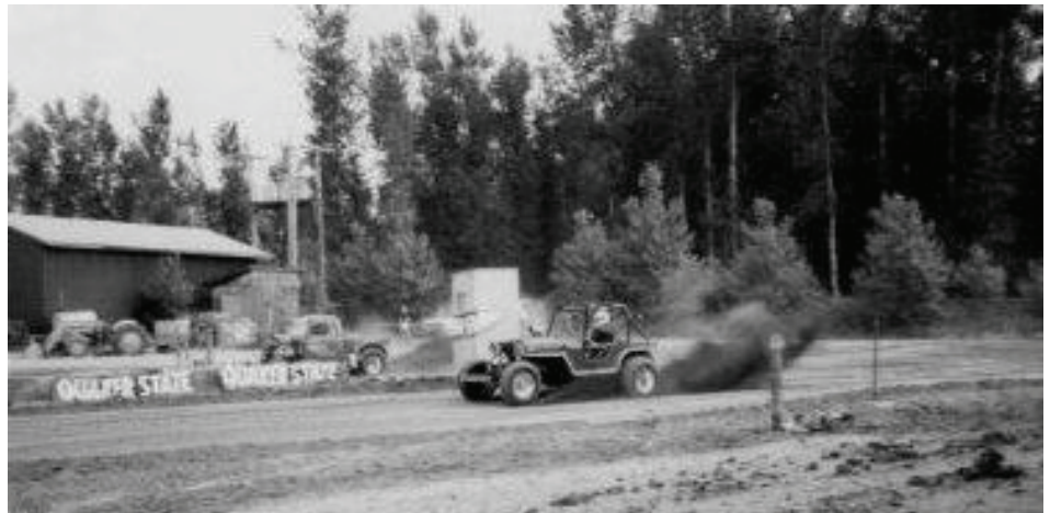
Jeep Off Road Racer