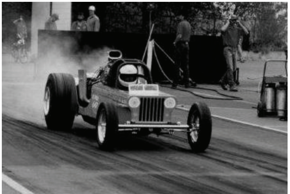
Drag Racing at Mission Raceway