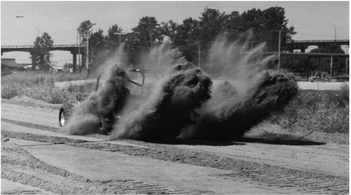
Dirt