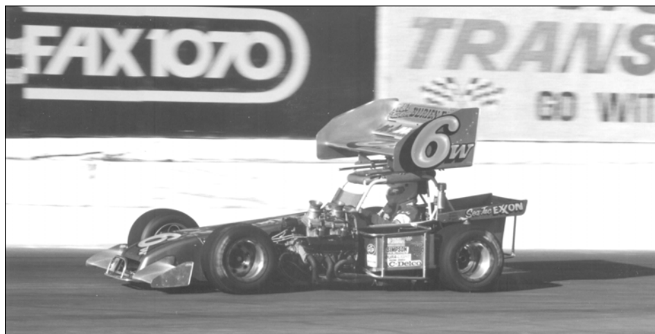
Super Modified at speed