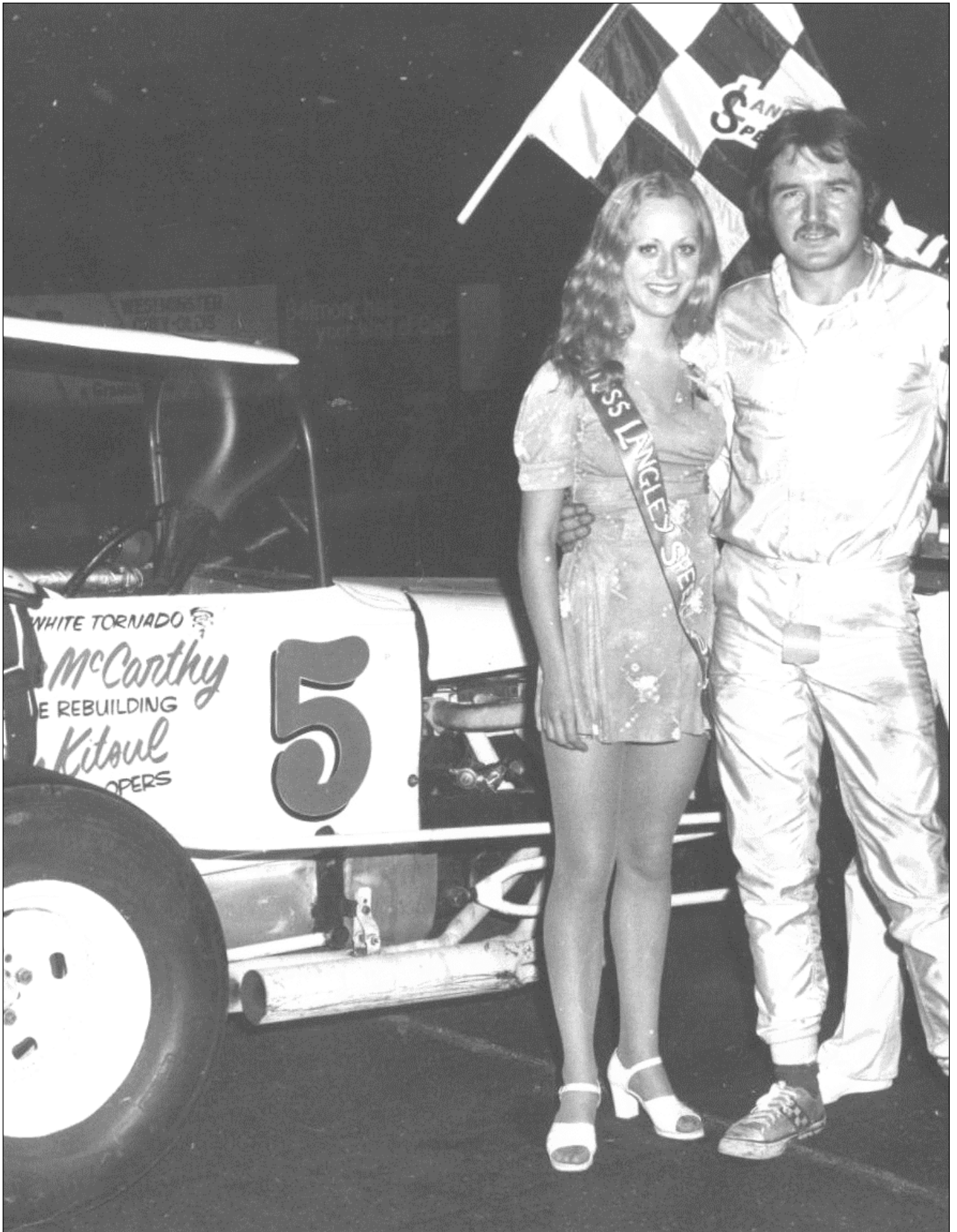
White Victory at Langley Speedway