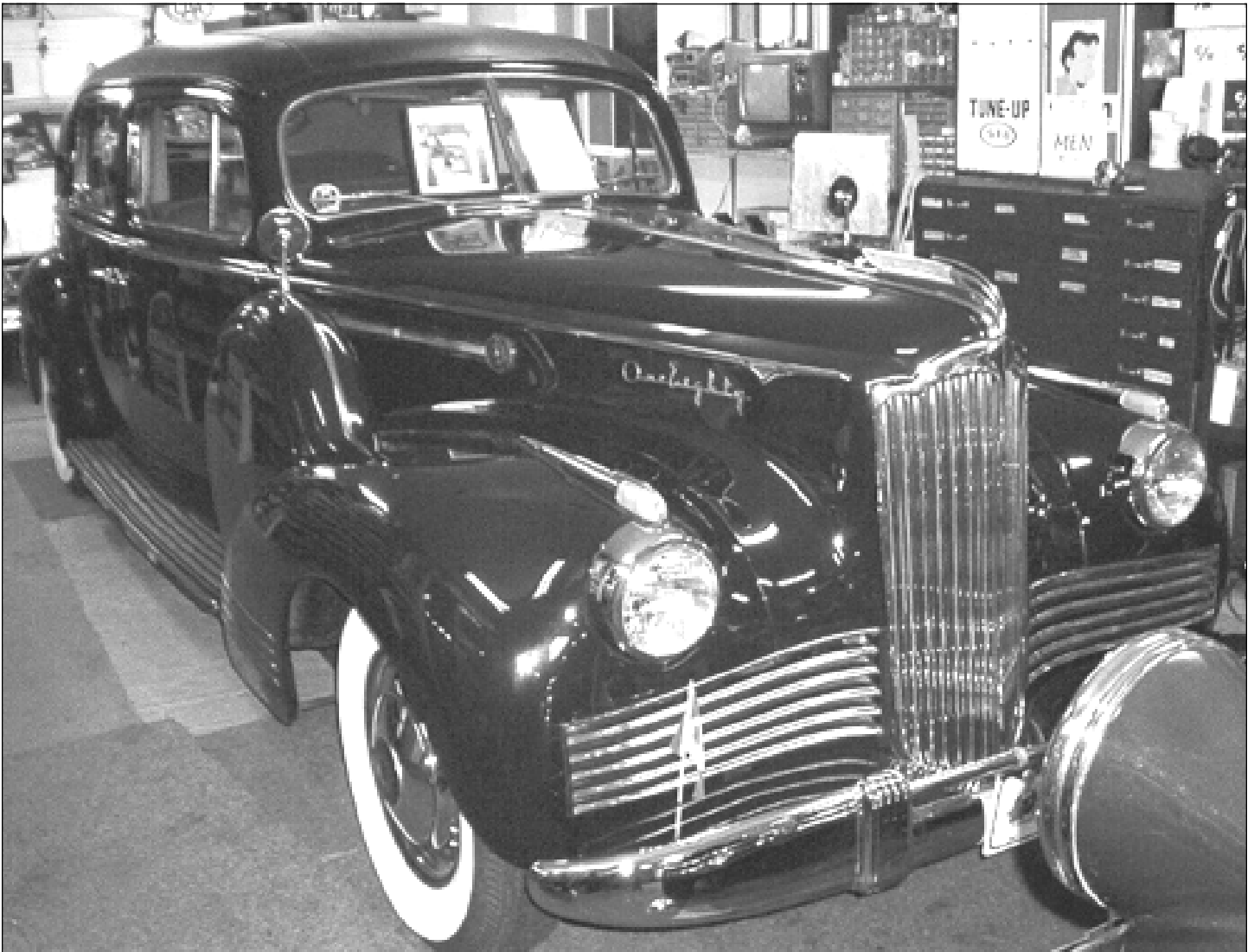
At the Tin Farm: (above) 1940 Packard 180 Sedan, (below) 1930 Pierce Arrow