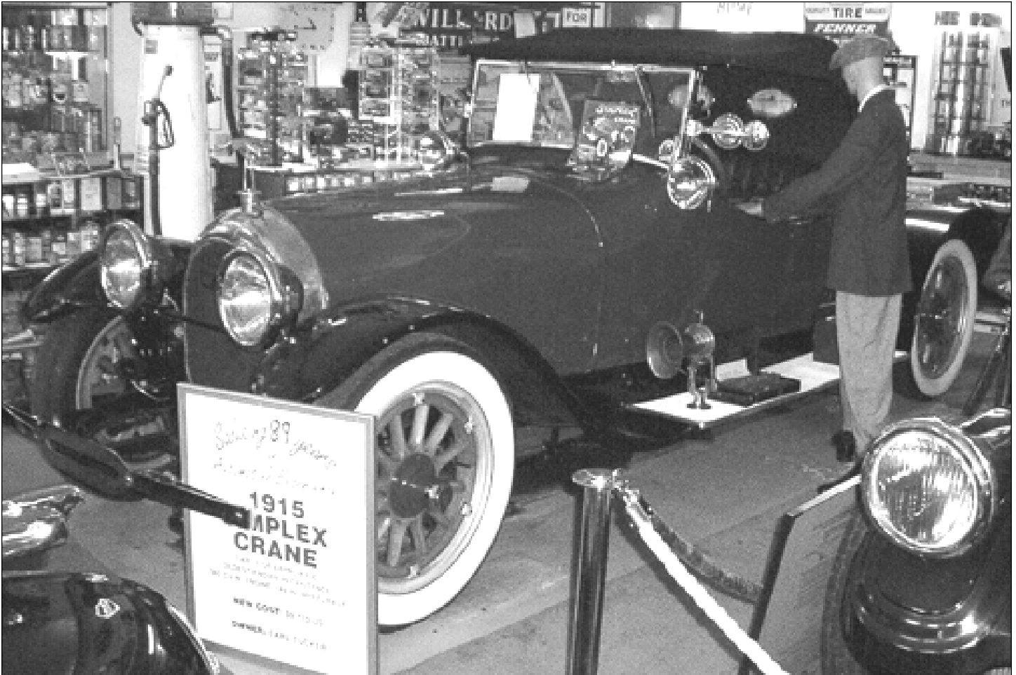
1915 Simplex Crane